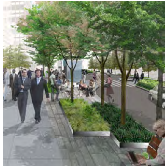
Strong Corner Presence at Main Street Intersection in Central Business District / Downtown Core: