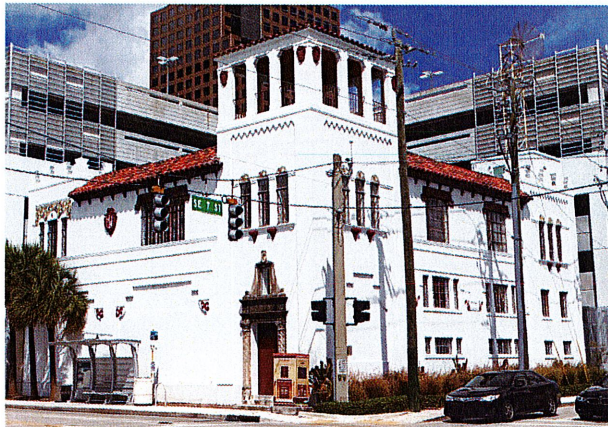
Photo of Existing Conditions

Included in the scope of work is the restoration of the existing steel windows with new impact glass retrofitted into the existing frame. Additionally, replacement impact windows are to be reinstalled to match the design and detail of the original windows in the three large openings on the west and south elevations that are currently enclosed. Details for the replacement windows are taken from photographic documentation as well as from another Coca-Cola Bottling Plant located in Ocala, Florida that is a mirror image of the Fort Lauderdale location and still has its original windows intact.