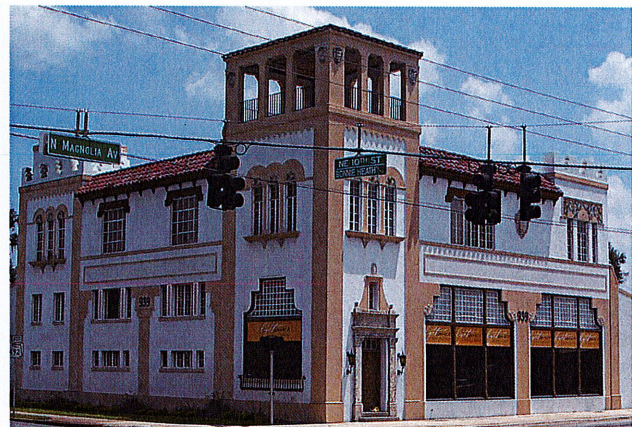
Photo of Coca-Cola Bottling Plant in Ocala, Florida

On the east and north elevations, minor alterations include new openings in select locations to accommodate egress requirements as well as to allow for additional natural light into the space. New openings are minimal in size, are not visible from the right-of-way, and are sensitive to the rhythm and scale of the openings throughout the façade, but differentiate themselves from the original. This approach complies with the Secretary