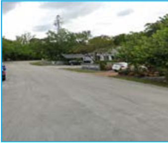
Before - SW 8 Avenue

The pavement marking program is a coordinated effort between Transportation and Mobility, the Public Works Road Services Team, and Broward County's Traffic Engineering Division. Over the past three months, Transportation and Mobility staff has completed site reviews and identified over 75 locations that are scheduled to be revitalized. These photos show recently completed enhancements in Tarpon River.