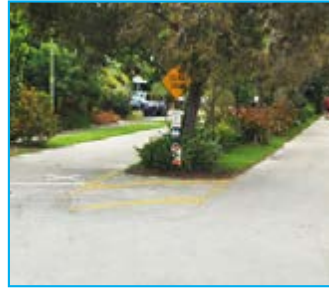
Before - SW 11 Court