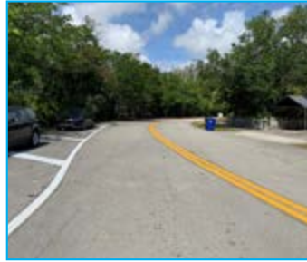
After - SW 8 Avenue