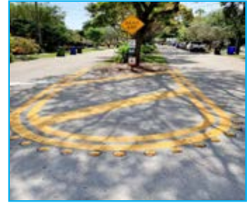
After - SW 11 Court