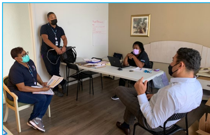
Volunteers and City staff supporting the City's Non-Congregate Hotel Program

The City leverages multiple funding sources to address priorities set by the City Commission, including the Homelessness and Housing Opportunities initiative. As a top priority, this initiative received $8,220,846 of external grant support for COVID-19 relief initiatives related to homelessness and housing assistance in 2020 and 2021. Funding sources, such as the Federal Emergency Management Agency (FEMA), Broward County Coronavirus Aid Relief and Economic Security (CARES) Act, the Florida Housing Finance Corporation's Coronavirus Relief Fund (CRF), CARES Act Housing Opportunities for Persons with AIDS (HOPWA-CV), and the CARES Act Community Development Block Grant Program (CDBG-CV), provided financial support for rent, mortgage, utilities, facility-based housing, and temporary hotel housing. The COVID-19 Non-Congregate Hotel Housing Program allows those without shelter to comply with social distancing requirements to reduce the spread of COVID-19. The program's goal is to transition participants into other housing assistance programs. A recent agreement with Broward County helps extend the COVID-19 Non-Congregate Hotel Housing Program through August 31, 2021.