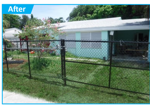
Housing Rehabilitation Replacement Program helps our neighbors