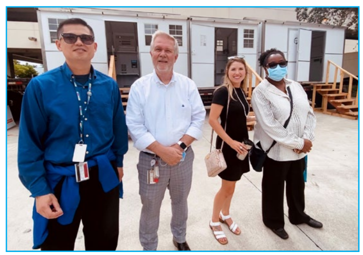
City Staff visiting Pallet Shelter demonstration

The City continues to research opportunities to support the homeless. A recent discovery was Pallet, a collapsible shelter which is offered in various sizes with a maximum capacity for a family of four. The fully installed cost of each Pallet shelter, including air conditioner and beds, ranges from $9,000 to $14,000. This innovative shelter system is made of highly durable aluminum and composite materials, and is designed to handle windstorms of up to 170 mph, allowing for safe shelter even during hurricane season. The City is currently exploring feasibility and partnership options to utilize the Pallet for temporary housing and with continual case management support. This novel idea could provide a safe environment for individuals experiencing homelessness and support them on their road to recovery.