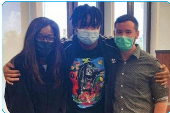
Photo of a young man who sought services as a walk-in, came back to Community Court to share his thankfulness to the network for assistance with shelter and job placement. He offered to provide outreach to others experiencing homelessness and inquired about volunteering to give back.

The Community Court Program continues to prove its worth in responding to the needs of neighbors experiencing homelessness. The continued success of this innovative program is catching the eyes of surrounding networks seeking to improve conditions in their areas. Several cities in Florida have inquired about the program's model and operation. Specifically, Miami Beach and Hollywood have visited the Community Court to learn more about how a similar program could possibly be implemented in their area. The City appreciates its partners for their collaboration and continued engagement to successfully serve our neighbors in need.