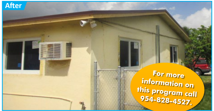
Before and after photos of a substantial rehabilitation project with roof, windows, and air condition replacement, as well electrical and other interior updates.

The City's Home Rehabilitation Program serves eligible neighbors by improving their living conditions through much needed home repairs. This program preserves the homes and removes the cost burden to homeowners. It promotes affordable housing by assisting households to remain in their homes without spending more than 30% of their income on additional housing repair costs. Home repairs include roof replacements, bathroom replacements, new flooring, new plumbing, impact windows and doors, hot water heaters, and air conditioning system replacements. In FY 2021, 18 owner-occupied housing rehabilitations were completed including one reconstructed home. As a result of the rehabilitations, these neighbors are living in safer, more decent, and habitable homes. The City's Housing and Community Development Division will continue its efforts to further the City Commission's priority of affordable housing through the Home Rehabilitation Program. For more information on the City's Home Rehabilitation Program, please contact Housing and Community Development Division at 954-828-4527.