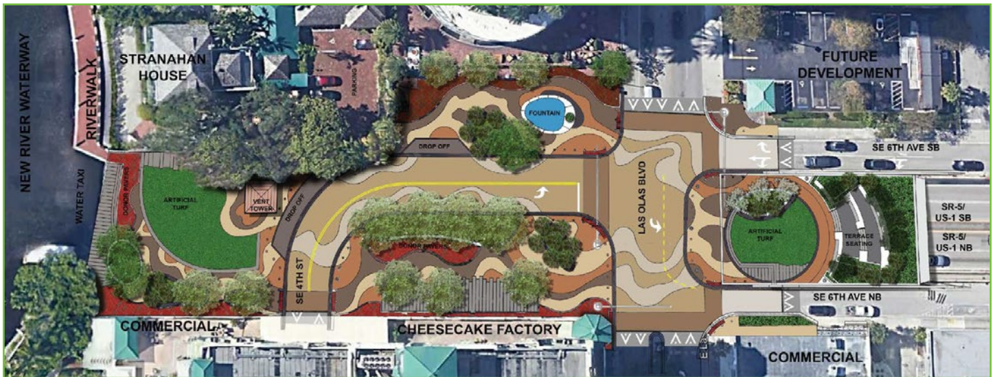
Overall Site Plan

The Tunnel Top Pedestrian Plaza Project is a joint initiative between the Florida Department of Transportation (FDOT) and the City of Fort Lauderdale to simultaneously rehabilitate the Henry E. Kinney Tunnel while expanding open space through the integration of a city park in the project plans. The multi-purpose collaboration will improve safety and mobility within the Las Olas area by upgrading the Tunnel to meet current infrastructure standards, removing barriers that create blind spots for vehicular and individual travelers, and transform one of the City’s key corridors into a pedestrian-friendly green space that seamlessly connects to the Riverwalk.