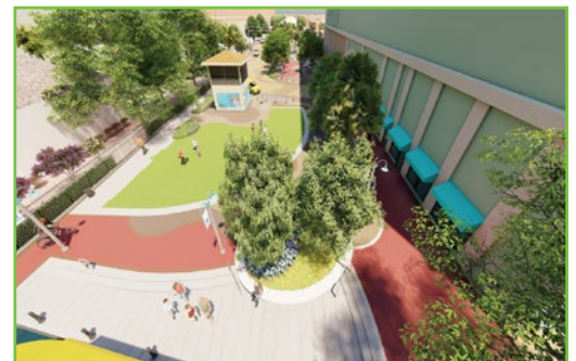
Laura Ward Plaza North View