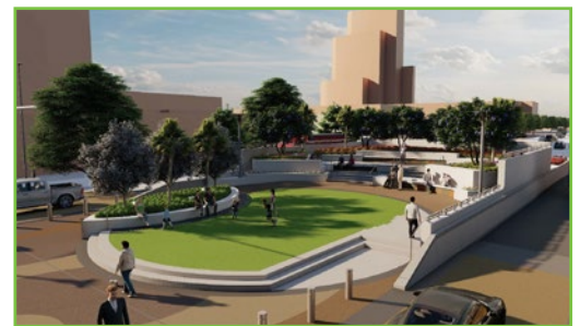
Tunnel Top Plaza Northwest View

In addition to overall tunnel rehabilitation, FDOT will incorporate technology enhancements with a focus on safety and real-time traffic monitoring; this includes the installation of Intelligent Transportation System (ITS) elements from