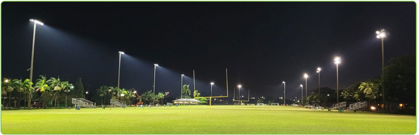
Photo of a Mills Pond Park field that shows new LED lighting on the left side and halide lighting on the right side

In addition to the new green spaces, the City has also been working to improve and maintain its existing spaces. Lighting improvements were made in six parks to transition from metal halide lamps to LED lighting for its play courts and fields. The new lighting will improve park lighting and offer increased energy efficiency, which is expected to result in significant cost savings and streamlined maintenance and repair activities. The City also enhanced funding for median maintenance in the Fiscal Year 2023 Budget. Approximately $1.4 million in new funding has been included to better design and maintain landscaping in medians and another approximately $221,000 has been included in the Community Investment Plan for streetscape improvements. Together, this funding will improve the look and quality of medians in the City.