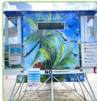
Lifeguard Tower 6