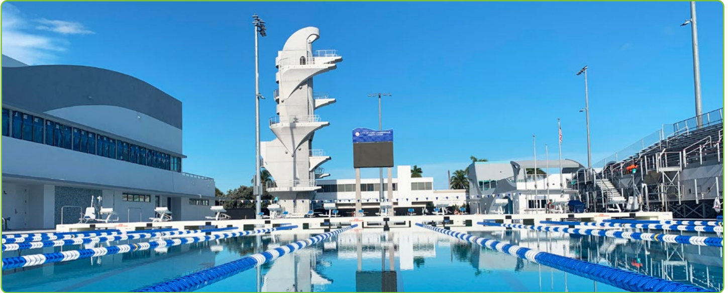
Photo of the newly renovated Fort Lauderdale Aquatic Center.

One of the milestone accomplishments of this past year was completion of renovations to the Fort Lauderdale Aquatic Center. The renovated complex features new pools, a 27-meter dive tower, scoreboards, locker rooms, and an amenity deck. The Aquatic Center is available and open to the public seven days a week; visit the City’s website at parks.fortlauderdale.gov for more information with a full listing of hours.