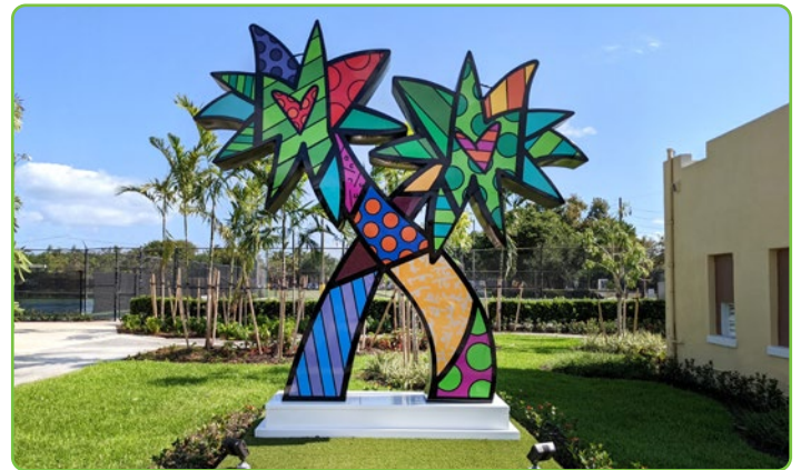
Sculpture by Romero Britto

In addition to the new green spaces, the City has also been working to improve and maintain its existing spaces. Lighting improvements were made in six parks to transition from metal halide lamps to LED lighting for its play courts and fields. The new lighting will improve park lighting and offer increased energy efficiency, which is expected to result in significant cost savings and streamlined maintenance and repair activities. The City also enhanced funding for median maintenance in the Fiscal Year 2023 Budget. Approximately $1.4 million in new funding has been included to better design and maintain landscaping in medians and another approximately $221,000 has been included in the Community Investment Plan for streetscape improvements. Together, this funding will improve the look and quality of medians in the City.