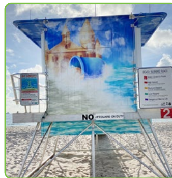
Lifeguard Tower 2

Other efforts to beautify the City include public art. This past year, a palm tree sculpture, crafted by Romero Britto, was generously donated to the City and stands in Florence C. Hardy Park. The City also transformed four lifeguard towers at the beach into art exhibits that boast and reflect the City's dynamic coastal life while serving as a critical beacon for those in need of assistance. In the near future, the City is looking forward to transforming another four lifeguard towers and various utility boxes throughout the City. Additionally, a steel seashell sculpture by Marc Quinn has also been donated for the James Winder Laird Arts Park at Tunnel Top Park.