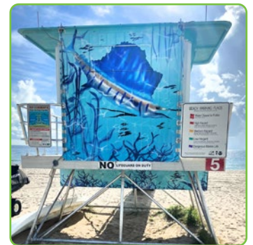
Lifeguard Tower 5