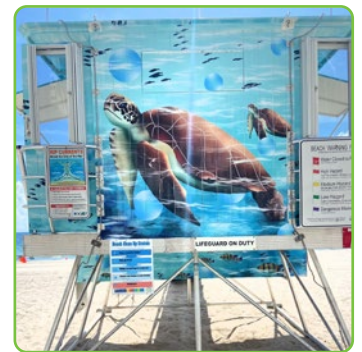
Lifeguard Tower 7

Other efforts to improve public spaces include the addition of six new pickleball courts at Benenson Park, resurfacing 25 tennis courts located at George English Park and Holiday Park, converting three Bermuda multipurpose fields at Mills Pond to synthetic turf, and resurfacing the pools at Carter Park and Croissant Park.