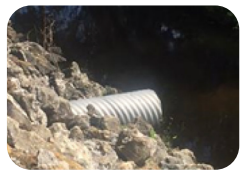
Outfall to New River

The Melrose Manors and Riverland Civic Associations with a combined area of 660 acres, have experienced extreme flooding conditions due to lack of infrastructure that can properly drain stormwater runoff from these neighborhoods. Currently, there are only grassed swales in residential areas and storm drains along major roadways bordering this watershed, but this is not enough to provide adequate drainage for these neighborhoods. The City of Fort Lauderdale is in the process of designing drainage infrastructure for the Melrose Manors and Riverland Civic Associations to significantly reduce the duration and intensity of flooding events within these communities.